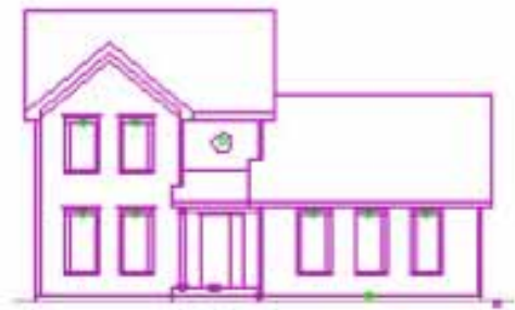
SINGLE FAMILY RESIDENTIAL